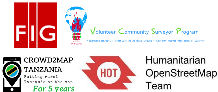
Logos of the organizers and facilitators

during the mapathon. The mapathon was supported with a YouTube playlist containing relevant themed music to keep the mapping team's energy sustained.