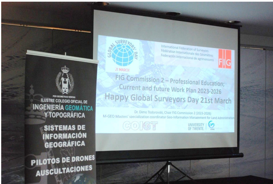
Photo from the European Celebration of the World Surveyors Day 2024, Madrid Spain.