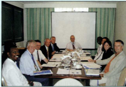
Commission 4 gathers

Commission 4 had an excellent conference! The planning of the papers was well thought out – we had a full hydro day on Tuesday 25 May that left us free to attend a technical tour on the Wednesday. This was a great idea; far better than spreading the Comm 4 sessions over two or three days. It also meant that those delegates with time pressures could fly in just for the main hydro day and catch the majority of the Comm 4 presentations.