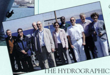
Commission 4 all at sea! - Technical tour on H/S O/S Nautilus

Commission 4 arranged a technical tour on board the Hellenic Survey vessel H/S O/S Nautilus. Our hosts were superb and we spent the day discussing survey issues (not to mention running some lines) and all under the glorious Greek sun.