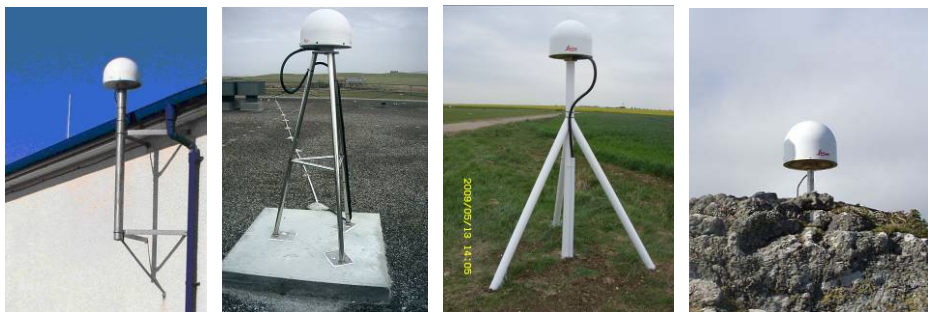
Above: photographs of typical OS Net CORS

There is a subset of some dozen stations which are installed with geodetic quality monumentation. Where available these are drilled directly into bedrock, else are mounted on helical pier tripods. These are due to be completed July 2009.