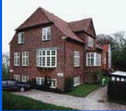
Holger MAGEL: Closing Address

More and wider work undertaken at a faster and faster speed with higher and higher efficiencies