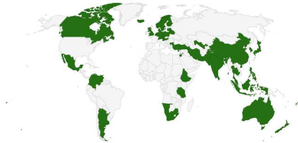
Fig. 1: 56 participating countries as of March 2018

In 2017, there was also a request by the Land Portal to have the Cadastral Template data included in their website. This request has been rejected by FIG and a suggestion for a less inclusive cooperation has never been answered from their side.