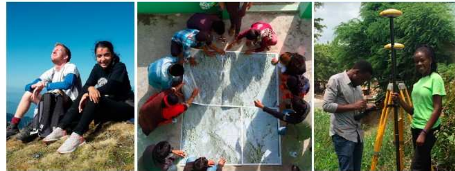
FIG Young Surveyors Network