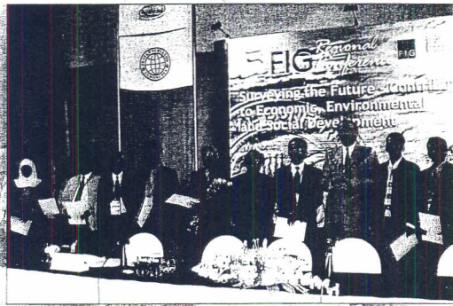
The whole organising committee getting thanks from the participants after a successful conference.

The second key topic was professional standards and qualifications in Asia, and in the ASEAN region in particular. This also provided the topic for a plenary session followed by discussion by a panel of experts. The third important topic was covered, in a new approach by a FIG conference, in a plenary session organised together with the World Bank on land-administration projects in Asia during which Keith Bell of the World Bank gave a keynote address. He also of-