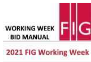
FIG Working Week 2021 - Call for Bids

Do you want the 2021 Working Week to take place in your country with your association as the local host? FIG invites all Member Associations to consider making a bid to host the prestigious FIG Working Week 2021 together with the Federation. The Council has prepared bidding guidelines for the Working Week.