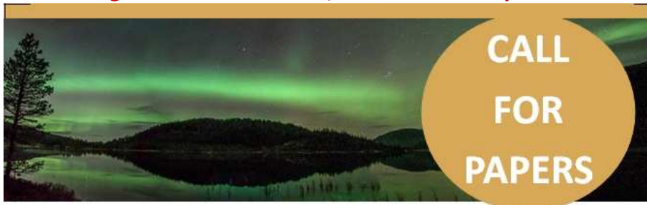
FIG Working Week 2017 will take place in Helsinki, Finland 29 May – 2 June 2017 at Messukeskus Expo and Convention Centre