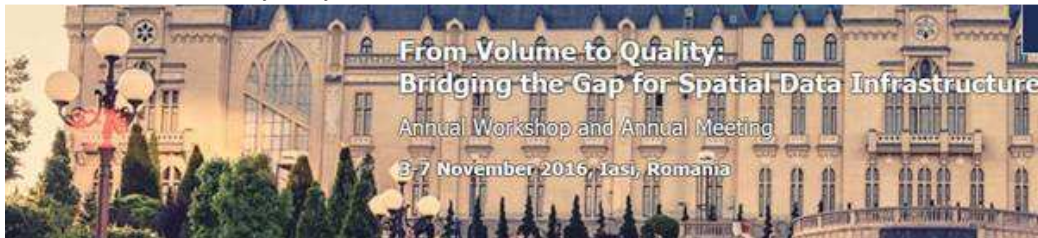
FIG Commission 3 Annual Meeting

Commission 3 Annual Meeting and Workshop "From Volume to Quality: Bridging the Gap for Spatial Data Infrastructure" – will be held joint to EGoS GA and Geomat 2016 "Spatial Information Management for Sustainable Development" - International Symposium. The annual meeting and workshop is held in collaboration with Romanian Surveyors Association.