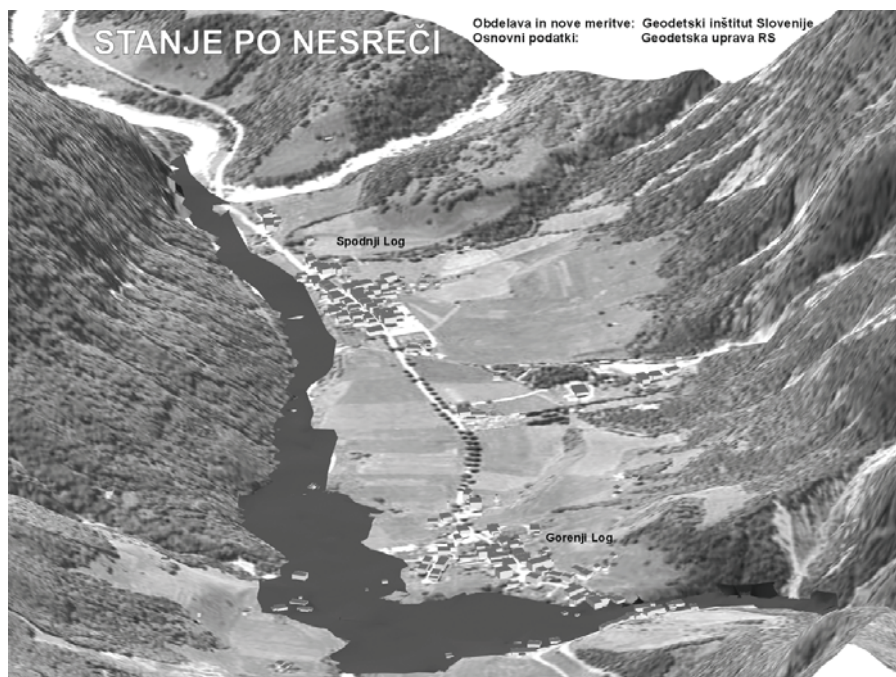
Figure 3: Visualization of situation after the landslide 1 .

Keeping actual 3D data on buildings on the national level is not feasible due to financial and methodological limitations. However, there is an emerging interest and there have been attempts on the part of individual local