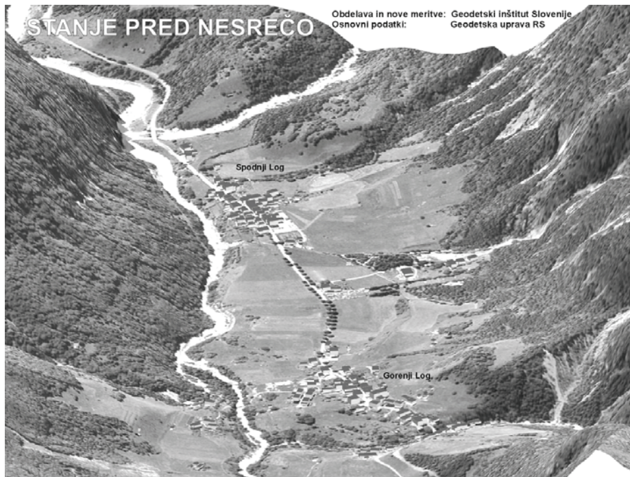
Figure 2: Visualization of situation prior to the landslide 1 .