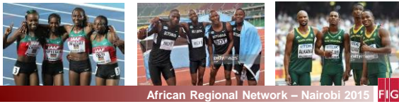
African Regional Network – Nairobi 2015 FIG