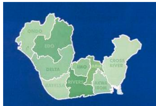
Figure 2: Niger Delta map