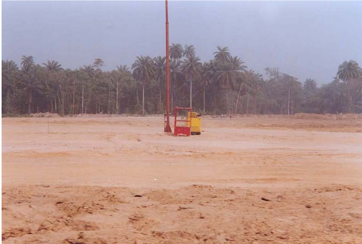
Figure 7: Reclaimed land of the camp

At the moment, 75% of the area has been filled to capacity and work is going on at top speed. Infact the residential area has been completed with all its facilities and the workers are already resident.