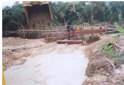
Figure 3B Swamp buggy creating a path into the site for the dredger