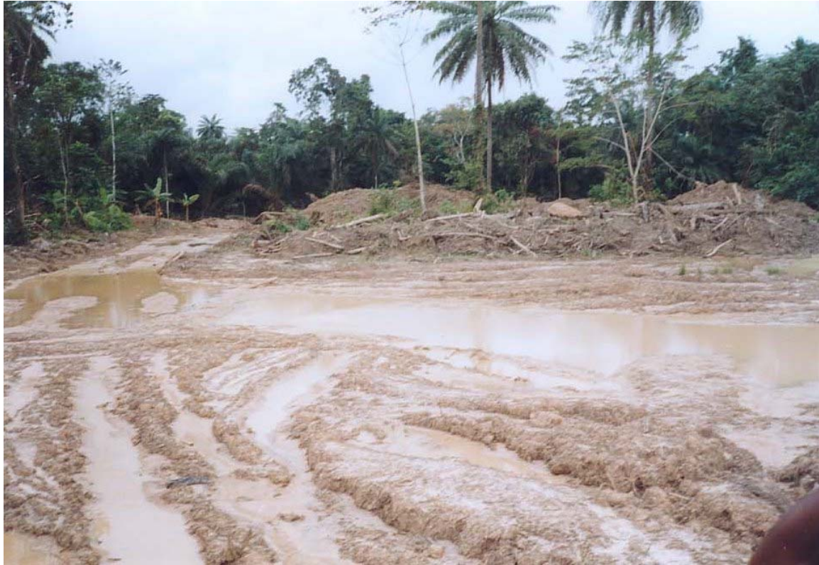
Figure 3A: Saipem camp site prior to reclamation