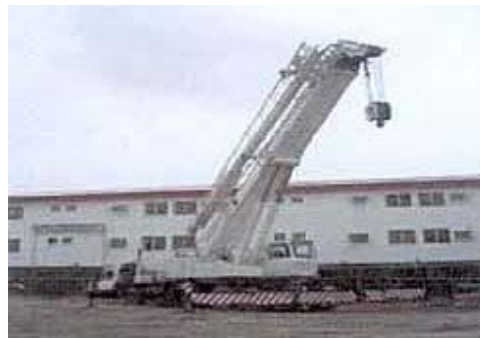
Figure 4B: Heavy-duty cranes capable of lifting up to 80 tonnes