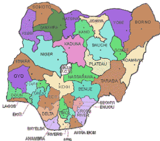
Figure 1 Map of Nigeria