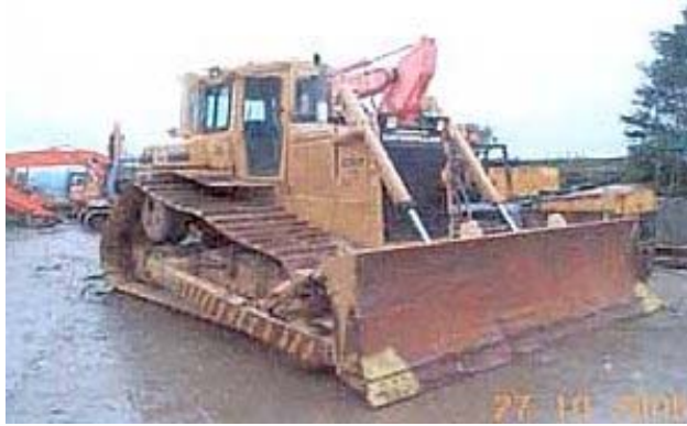
Figure 4D: Catrepillar d6 v-track bulldozer.