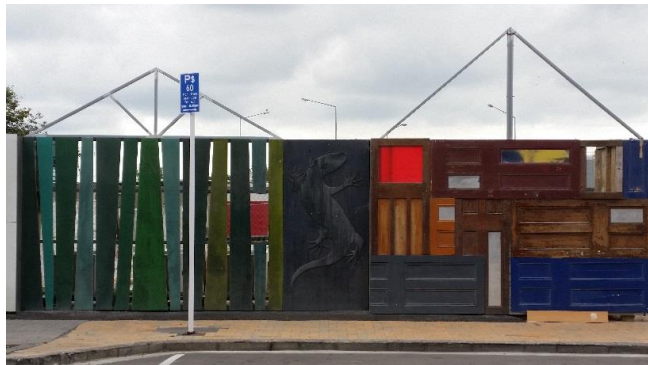
7. Some construction public viewing windows are simply holes in the safety fence while others are graced with more artistic flair

Something to ease the frustration around the CBD construction sites I've noticed is viewing portals in many site fences allowing the passing public a chance to see what is going on. This helps put the banging, vibrating, dust, cranes, crossing trucks into perspective. Not every construction site has viewing windows but for those that do it's really interesting to sneak a look to check on progress – especially if you are interested in concrete reinforcing and structural steel!