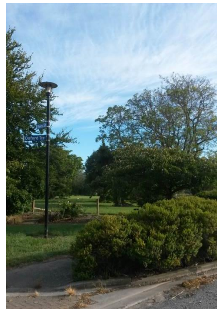
2. Light poles and street signs stand proud despite houses and people no longer present.

The most obvious consequence of those disastrous events is the suburbs of desolation. They no longer resemble war zones with abandoned buildings, inaccessible roads, roadside piles of liquefaction and collections of portable toilets that I witnessed on earlier visits to the city. Now they are grassed areas complete with original street signs, backyard trees still standing, service connections boxes remain at the boundary but nothing else. These scenes are almost as unnerving as the destruction was. A neighbouring territorial authority in the same situation has recently released a consultation document to transform abandoned suburbs into recreation areas, cemeteries and rural land.