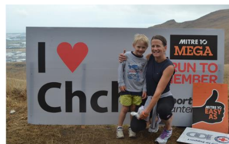
11. A mother and son stop to strike a pose during the annual Run to Remember

A memorial wall is currently being built on the banks of Avon River to commemorate the earthquake events that changed the city of Christchurch forever. Earthquake anniversary ceremonies and fun runs are a couple of ways the community joins together to remember and regroup. For my family this is the opportunity to show support and a cue to familiarise ourselves with emergency procedures.