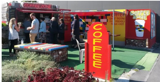
9. A favourite morning coffee escape from the office, including a street busker on Thursday mornings! These hardy souls are known to happily brave the winter weather for a good coffee. Who knows how long before construction will start on this commercial site?

Pop-up shops and cafes and bars with unconventional or non-traditional styling are accepted more than ever expected. Many of these spaces provide a vibe or feeling that the customer is part of the overall experience – not just sitting at table drinking a cappuccino.