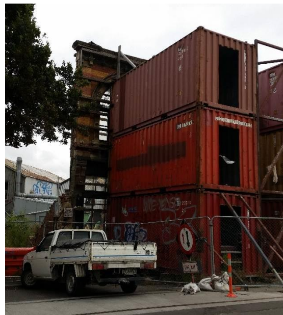
4. Containers are not just for shipping – a common use around the city is as temporary support of historic facades

Rebuilding a city is complicated. I’m impressed that a selection of contractors and consultants and government agencies combined to form SCIRT (Stronger Christchurch Infrastructure Rebuild Team) to formulate and implement a complex and essential citywide repair and rebuild programme for roads, fresh water, wastewater and storm water networks. As of early February 2016 SCIRT is 86% through the programme of works. December 2016 is the target that contractors and consultants are striving towards to be substantially completed.