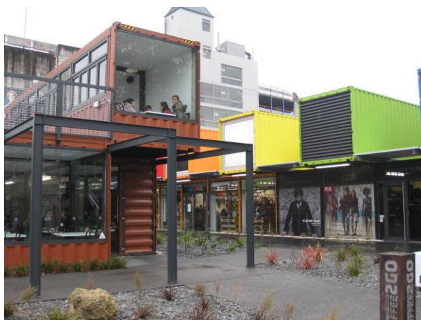
8. Not just another coffee shop or clothing boutique - the retail experience is something for all the senses to enjoy at Re:START mall

An important part to the vitality of the CBD city mall area is the Re:START mall – a little oasis of colour and vibrancy within the damaged and demolished wasteland of the central city Red Zone. At the time of opening in October 2011 it was a shopping mall built from shipping containers originally planned for 6 months. Four years the mall has relocated to make way for inner office construction but has expanded to over shops and businesses. Since opening, Re:START has been the cornerstone for the tourism industry in Christchurch and has helped rocket Christchurch to number six in the Lonely Planet Guide to the ‘must visit’ places to visit in the world.