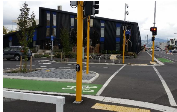
12. A brand new CBD street has fresh asphalt, dedicated cycle lane, latest technology street furniture and essential fixtures, and landscaping

The future for Christchurch is very strong – not many cities in the world will have the opportunity to build a new CBD, new public spaces, new commercial buildings and residential development combined with replacement of aged drainage systems and new roading and cycle networks. The latest technologies have been able to be utilized and installed and the public have had multiple opportunities along the way to have their say. This will undoubtedly become the most modern city in NZ and who wouldn't want to be part of that?