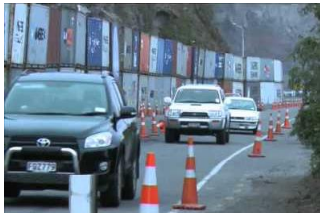
1. The line of shipping containers imposes on access to and from popular Sumner Beach but protects road users from rock fall

Staff worked around the clock to minimise disruption when carrying out repair and protective work. An example of this was the night-time installation of a double-height container wall for rock fall protection several of these are still in place today.