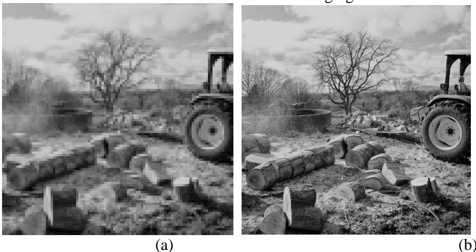
Figure 3(a) shows the quality of the enhancement by combining via LSP the 40 low-resolution images using the sub-pixel shift calculated through the registration technique of section 2. The accuracy of the reconstructed image was determined by subtracting it from the true initial image. The difference produced a grey scale R.M.S.E. (Root Mean Square Error) of 12 pixel intensity values with maximum and minimum errors ranging between -16 and +18 pixel intensity values.

Also, each of the 40 low-resolution images was jpeg compressed using the same compression ratio (10:1). No rotations were applied when scanning the low-resolution images. Correlation obviously exists amongst a sensor and orientation parameters such as tilts, rotations and affinity/obliquity of the sensor (as those found in digital and video cameras) and, in a controlled experiment where the intention was to ascertain a resolution enhancement process in itself, it was considered unwise to include such intricacy.