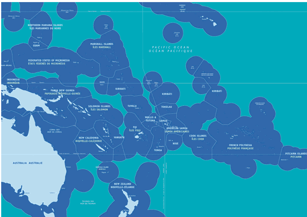
Figure 1; Secretariat of the Pacific Community Member Countries

Secretariat of the Pacific Community (SPC) is the Pacific Island region's principal technical and scientific organisation. It delivers technical, scientific, research, policy and training support to Pacific Island countries and territories in fisheries, agriculture, forestry, water resources, geoscience, transport, energy, disaster risk management, public health, statistics, education, human rights, gender, youth and culture. SPC was established in 1947 and employs over 600 staff. Its headquarters are in Noumea, New Caledonia, with other offices in Fiji, Federated States of Micronesia and Solomon Islands. SPC has 26 member countries and territories including its founding members, Australia, France, New Zealand and the United States of America, which contribute a large proportion of its funding. Other major development partners are the European Union; Global Fund to Fight AIDS, Tuberculosis and Malaria; United Nations agencies; Asian Development Bank; World Bank and Global Environment Facility.