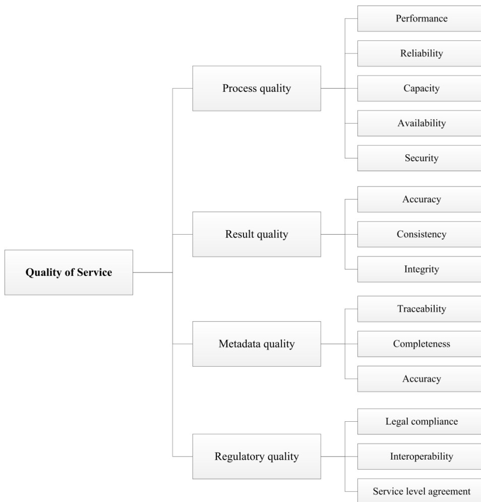
Figure 4 Structure of quality of service