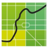
FIG Working Week 2016