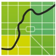
FIG Working Week 2016