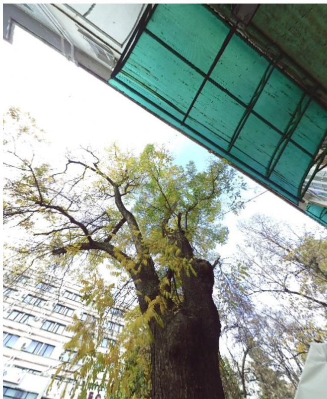
Fig. 1 The tall trees, situated next to the object

Another situation should be also observed in the field during the performing of the measurements. According to the technological possibilities of the scanner for creating 3D panoramic photos, the area around the scanner should be kept clear in order to be produced quality photos, required for the further geodetic activities, like recognition of the measured details of the object.