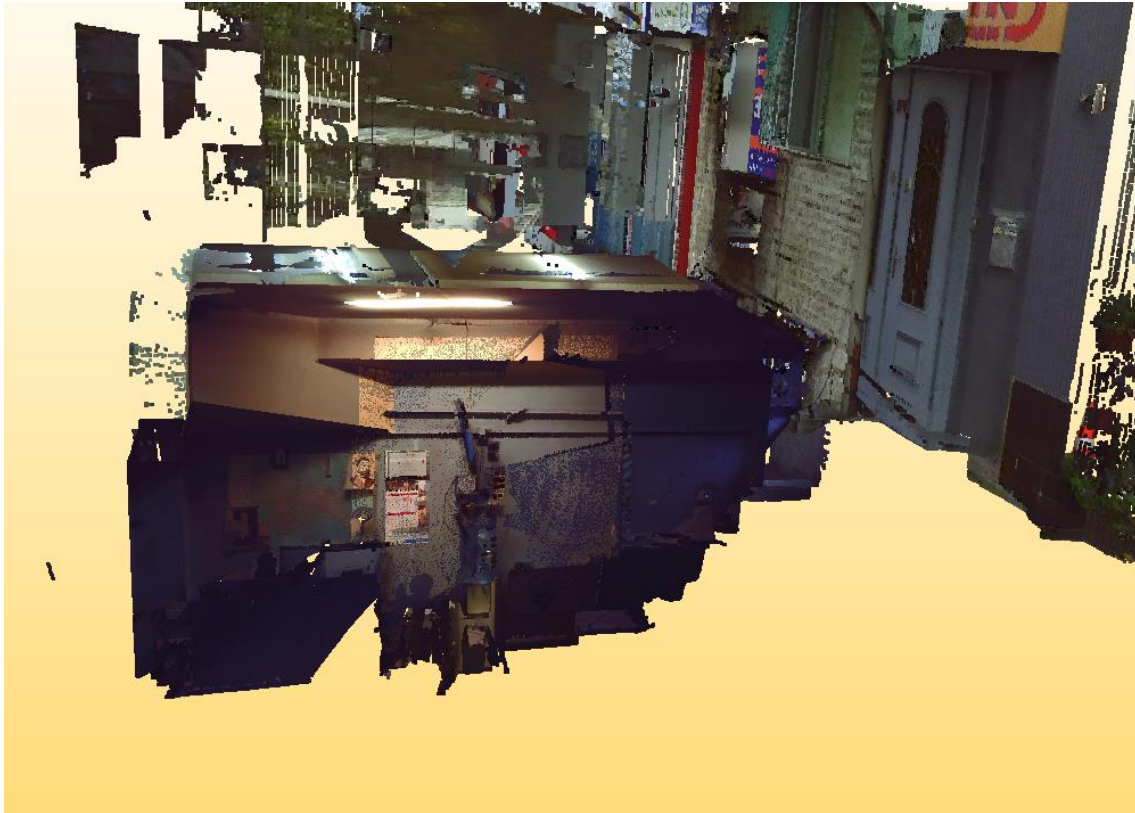
Fig. 5 The underground object

One part of the digital product – an extracted horizontal cross section (using the possibilities of Trimble Realworks) is given in fig. 6. In our case it was used to be obtained information for the position of the object in order to be created the digital model of the so called scheme of a separated object on the relevant floor of the building. In blue colour is denoted the point cloud and in green – the measured object. The nearby objects like stairs, walls, etc. could also be recognised.