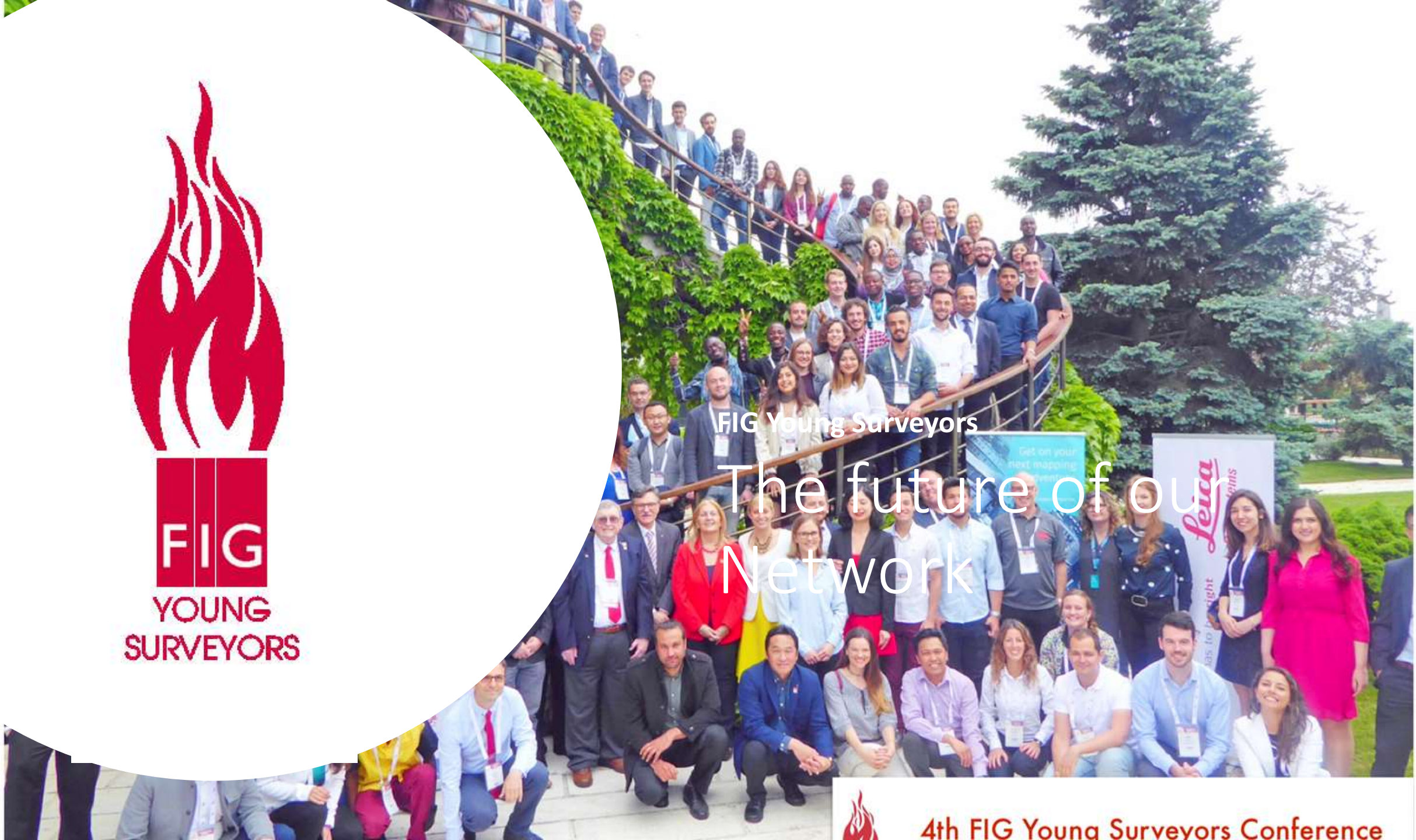
FIG Young Surveyors