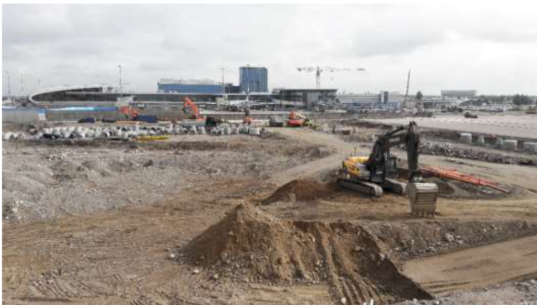
Helsinki Airport expansion project with model-based workflow, photo by Tero Maijala.

With digital design models, it was possible to use these models directly in the machines fitted with machine control systems, so the additional physical markings in the field were not anymore needed. This was also the most visible change in the process and infrastructure project locations could not be any more defined by the hundreds of wooden stick standing on construction sites.