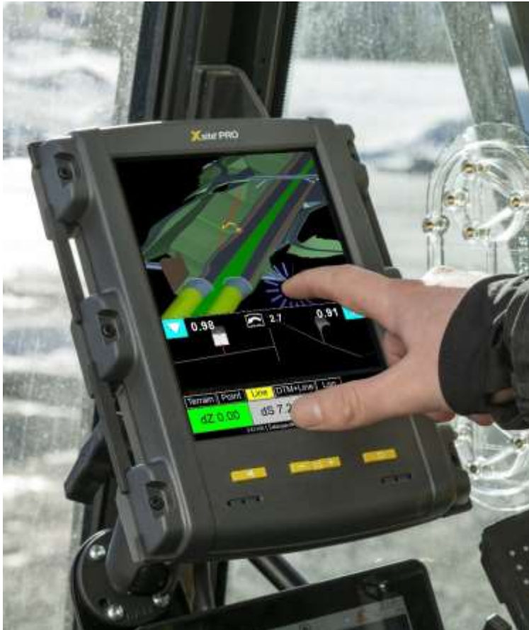
Inframodel format road design seen on a machine control system screen in an excavator.

In the new model-based workflow, instead marking out with physical of stakeout sticks, the quality-controlled models were transferred from the project office directly to machine control systems in the field. Making latest design data available for the machine operator with just few clicks on the touch screen.