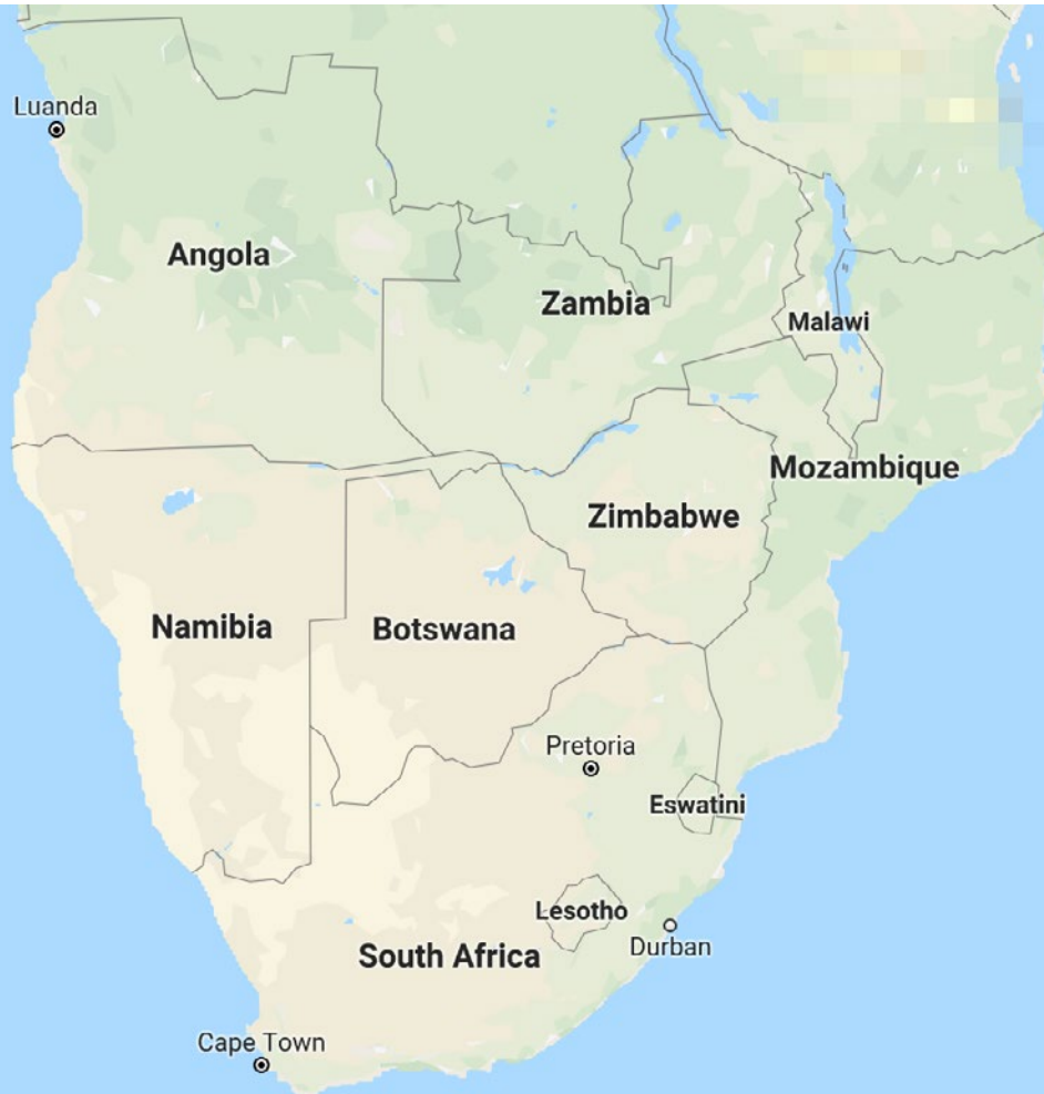
The Southern Africa Region.

This project on “Land Governance in Southern Africa” covers a description and assessment of Land Governance in the Southern Africa Region (Africa mainland south of Tanzania and the Democratic Republic of Congo). The project covers ten countries: Angola, Botswana, Lesotho, Malawi, Mozambique, Namibia, South Africa, Eswatini, Zambia and Zimbabwe. Eight countries are completed while Angola and Mozambique are still pending.