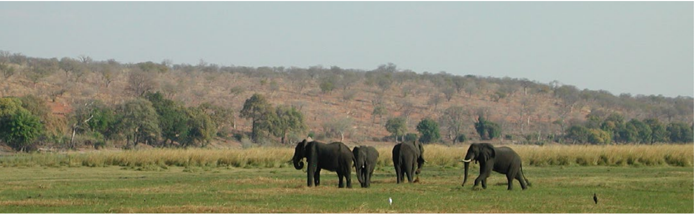
Kasane river delta, Botswana