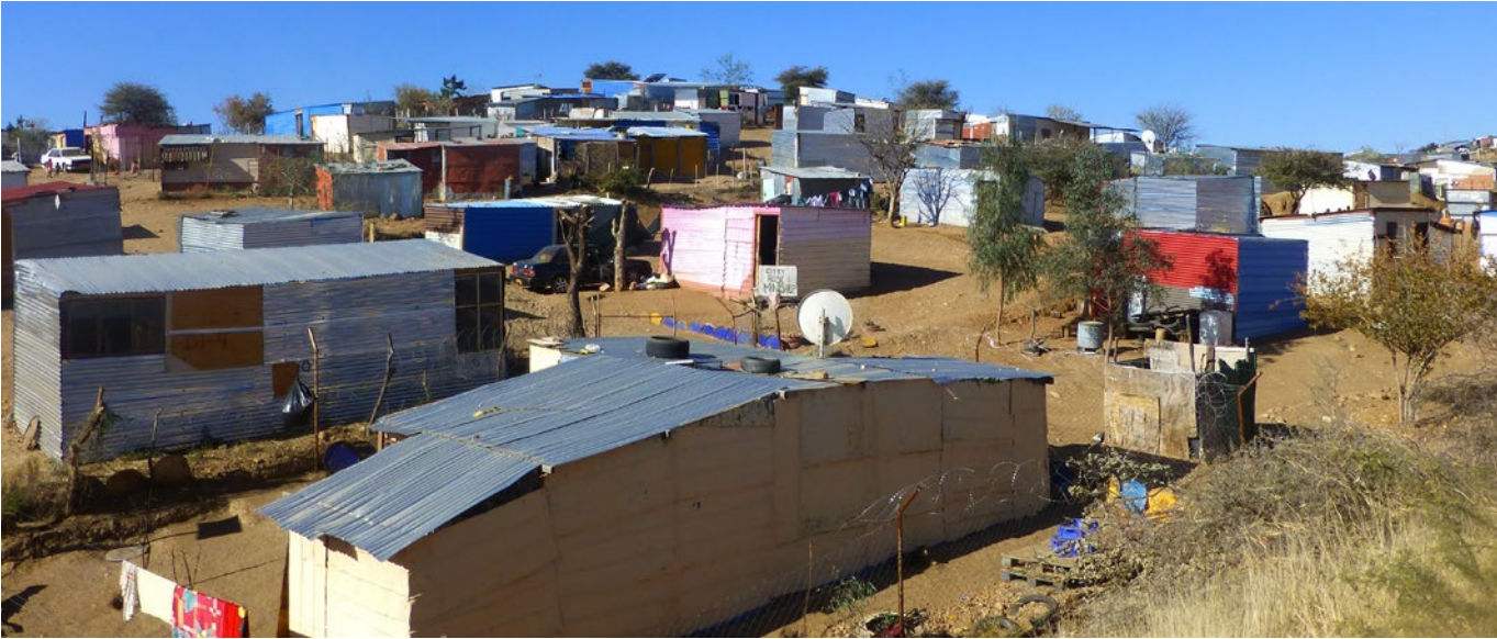
Informal settlement, Windhoek, Namibia