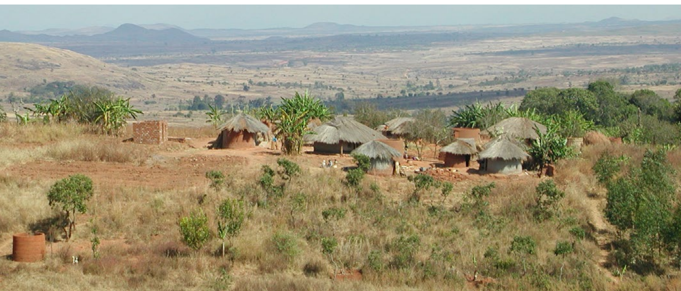
Customary tenure area, Mozambique

Land administration is technically complex and cuts across many disciplines, such as law; information technology; geodesy; geomatics and surveying; economics; urban planning; anthropology; and environmental, social, and political sciences. Some of these fields are rapidly advancing, making it important not to remain with outdated solutions but rather to design systems in a way that anticipates future improvements. A key challenge is also to make trade-offs that help improve overall system performance rather than focus on over-engineered approaches that may be appropriate from a disciplinary perspective but weigh down the system and eventually make it unsustainable. While these trade-offs are ultimately a policy decision, a framework for the land sector can help to identify key areas of concern and guide support for developing an integrated strategy. (World Bank, 2012, 20)