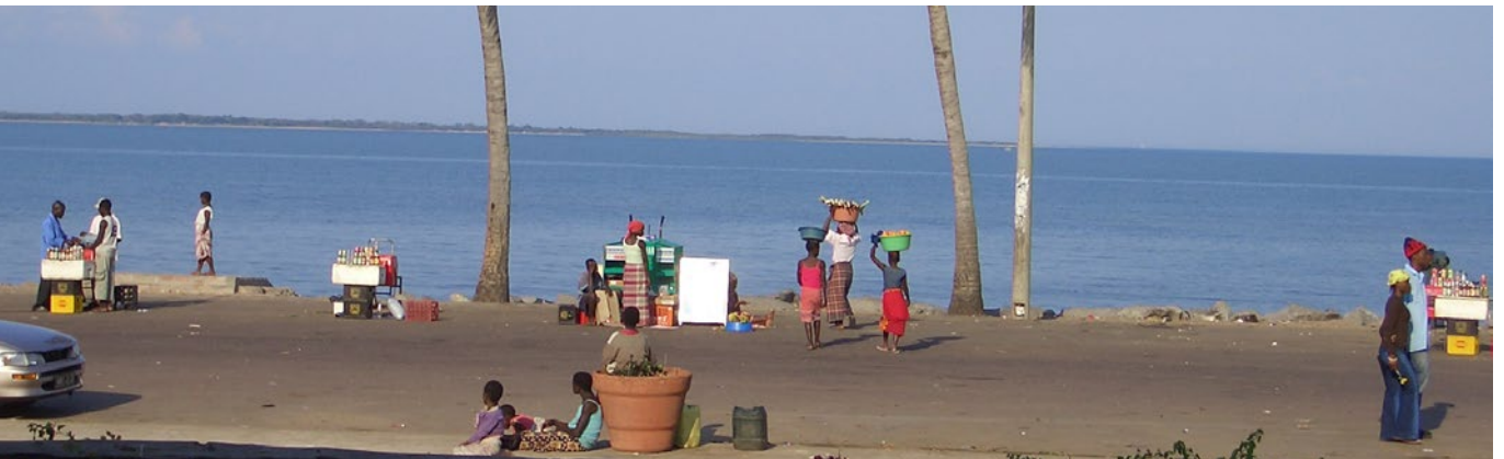
Beach market, Maputo, Mozambique