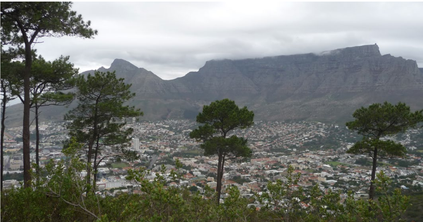
Table Mountain, Cape Town, South Africa

In turn, this can facilitate identification of further research projects to be undertaken for improving the national land governance concept.