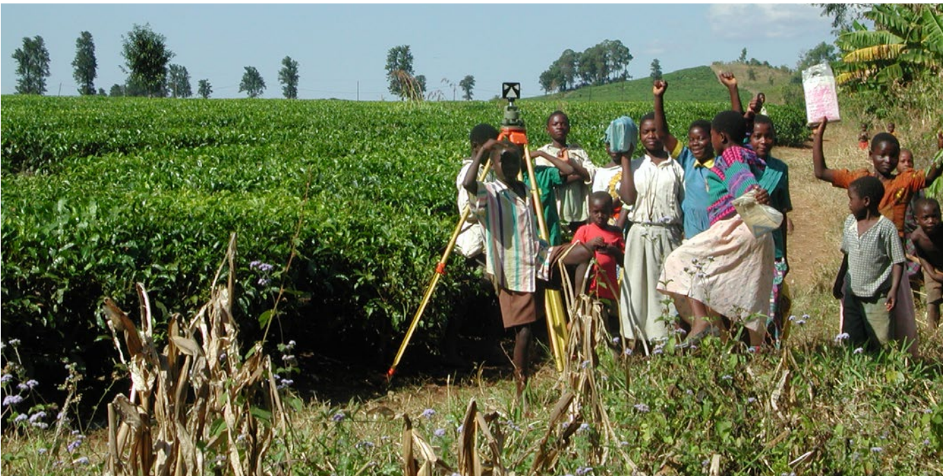
Surveying the future, Malawi